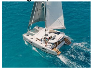
Starting at: $6000/week