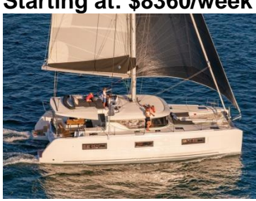
Starting at: $8360/week