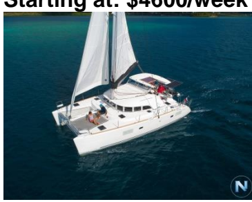
Starting at: $4600/week